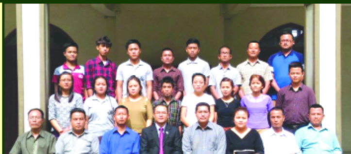
Lungdai Hmar Veng Branch Leadership Training cum Evangelical Night