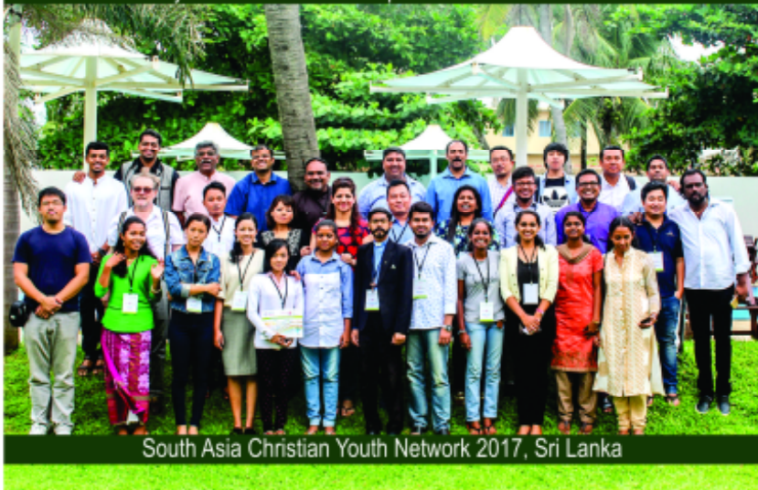
South Asia Christian Youth Network 2017, Sri Lanka