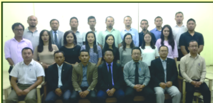
Dawrpui Branch YRC Night