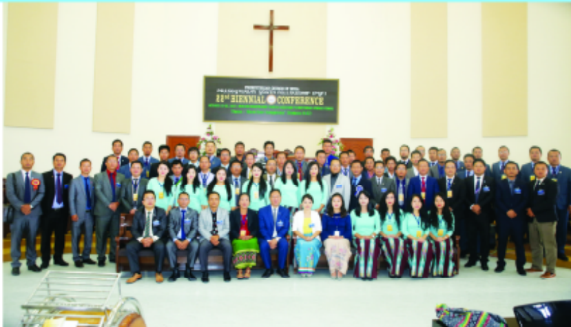
Presbyterian Youth Fellowship Biennial Conference 2017

Kristian Thalai Pawl Chanchinbu thla tin chhuak