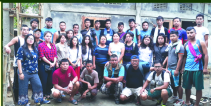
Luangmual Bial Workcamp @ Joypur