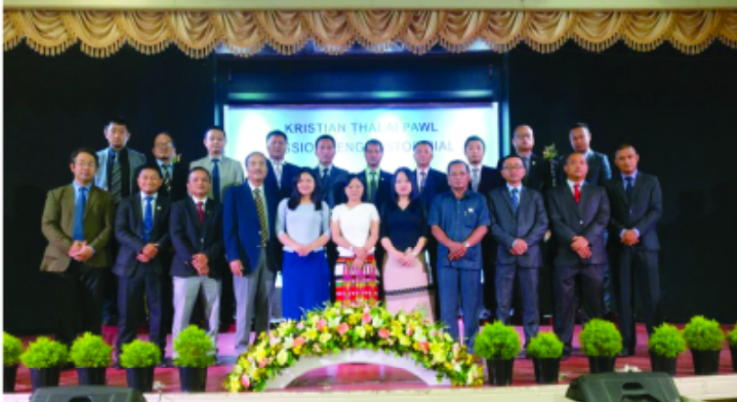
Mission Veng Bial K.T.P Diamond Jubilee – Bial hrulaitu