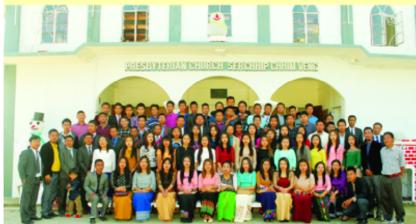
Kantu – Serchhip Chhim Veng Branch