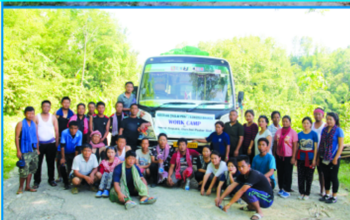
Lungdai Branch Workcamp @ Dononjoypara