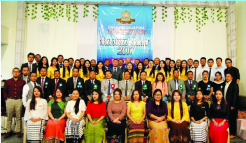
Delhi Branch K.T.P. Musical Meet 2017

Kristian Thalai Pawl Chanchinbu thla tin chhuak