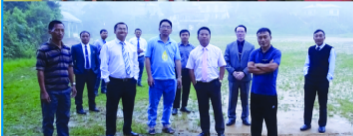
KTP General Conference Vawi 52-na Organising Committee leh CKTP hruaitute