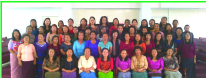
Durtlang Bial Leadership training

Postal Regn. No. MZR/ 53/ 2015 – 2017 RNI Regn. 40876/ 88