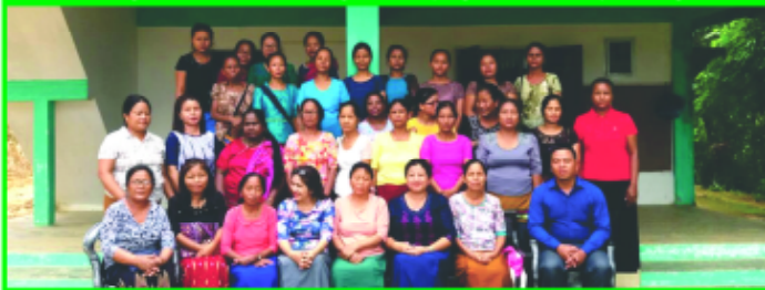
Tlabung Zodin Kristian chhungkaw campaign & Leadership training