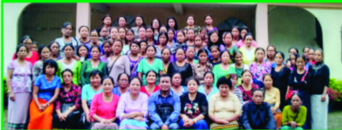
Rengdil Bial Kristian chhungkaw campaign & Leadership training