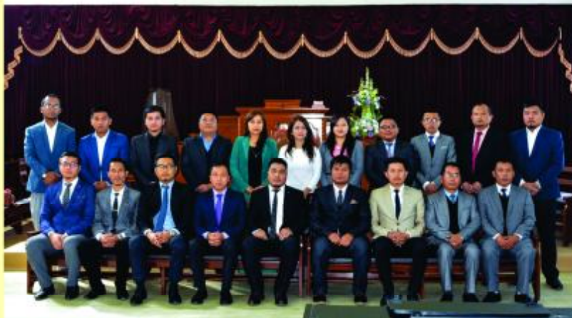
Kantu – Nursery Branch