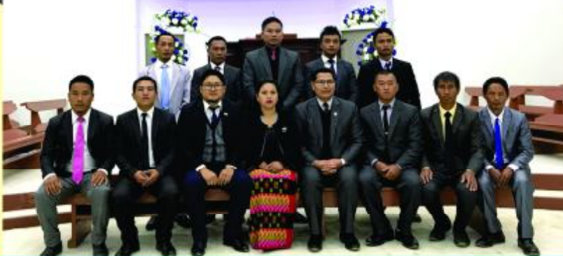
Chhingchhip Bial KTP Conference @Venghlun Kohhran