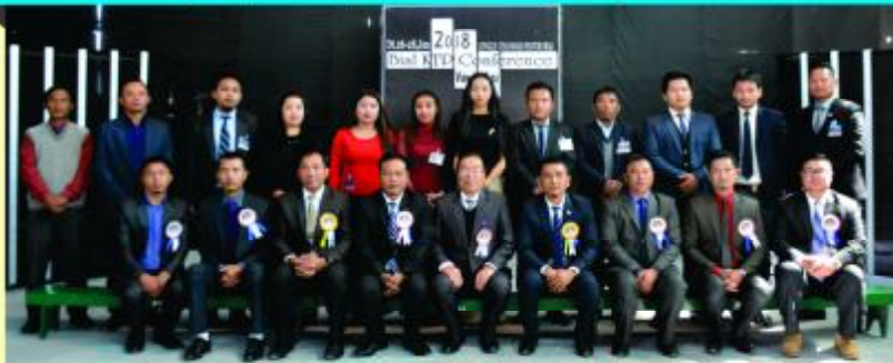
Lunglei Chanmari Bial KTP Conference @Ramthar Kohhran