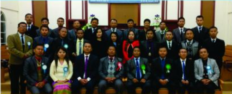
West Phaileng Bial KTP Conference @Dinthar Kohhran

Postal Regn. no. MZR/81/2015-2017 RNI No. MIZMIZ/2009/29074