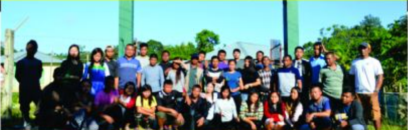
Sihphir Bial KTP Workcamp