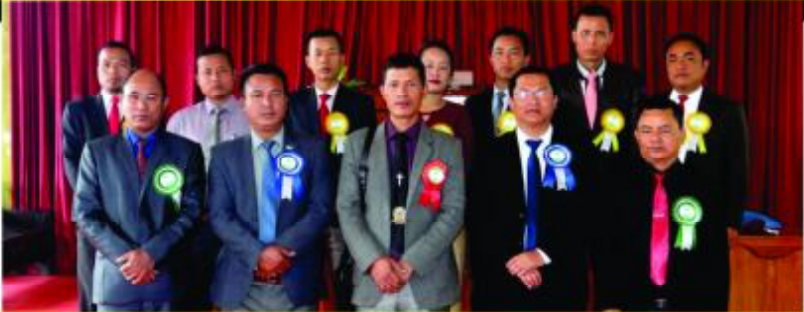
Zawnuam Bial KTP Conference @Bawrai Kohhran