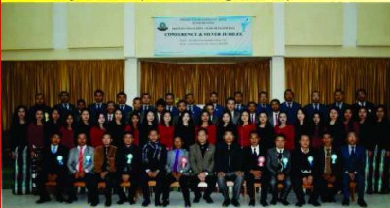
Sumsuih Bial KTP Conference @ Sumsuih