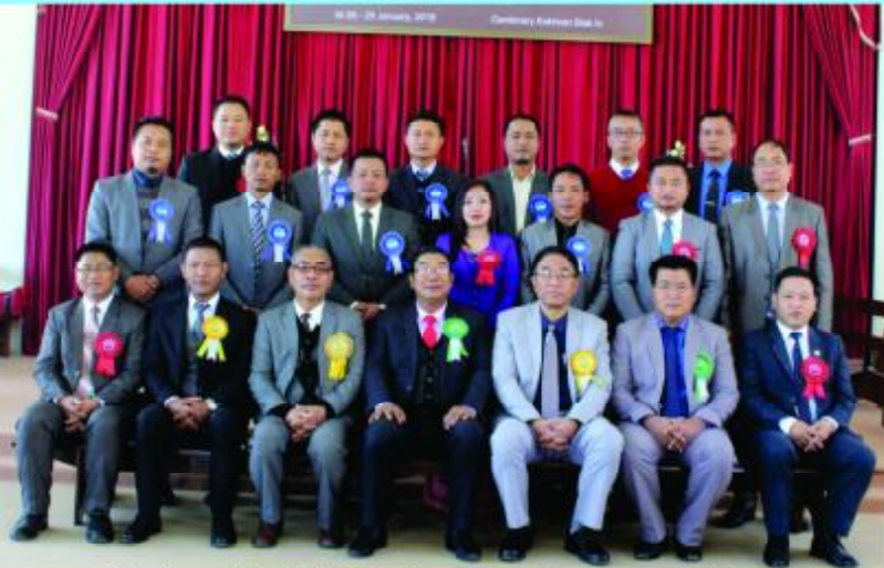
Venghnuai Bial KTP Conference @ Centenary Kohran

Kristian Thalai Pawl Chanchinbu thla tin chhuak