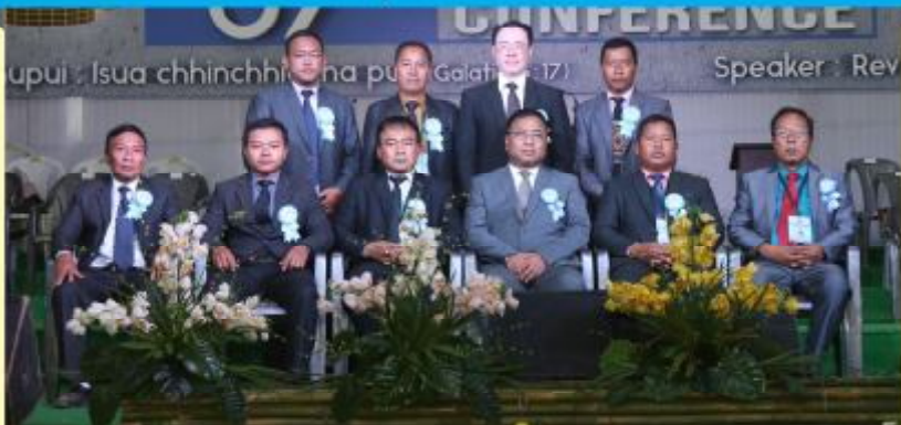
57 th KTP General Conference Organizing Committee