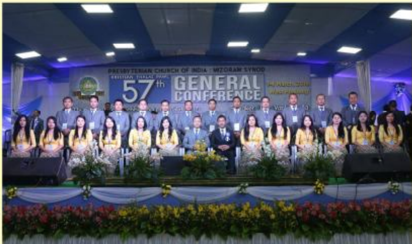
Mizoram Synod Choir 2016-2018