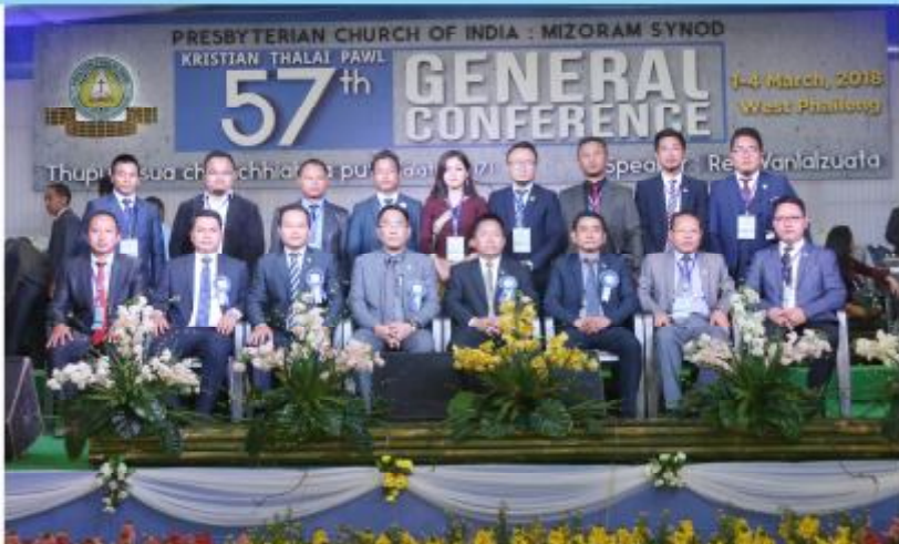
General Conference Documentation Team

Postal Regn. no. MZR/81/2018-2020 RNI No. MIZMIZ/2009/29074