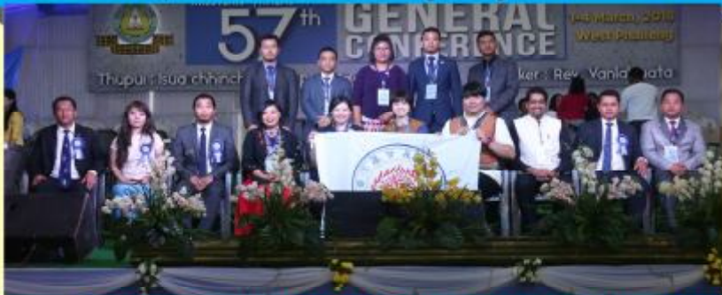
General Conference-a Hospitality Sub-Committee leh foreign atanga lo kalte