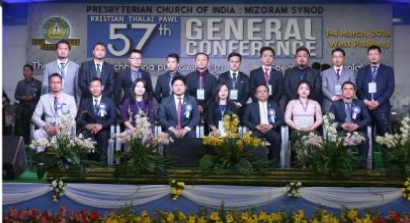
General Conference zai hruaitute