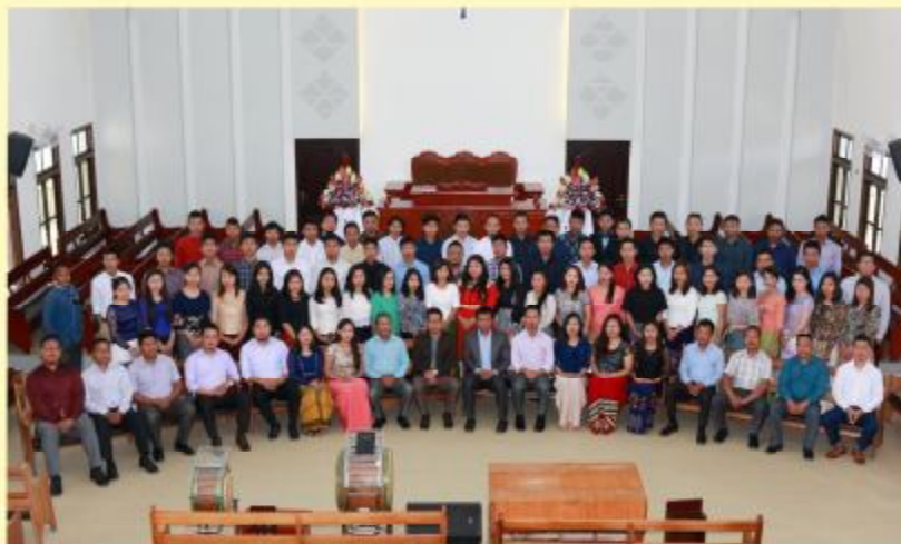
Kantu – Tianguam West