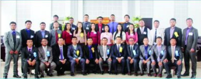
Champhai Kanan Branch Diamond Jubilee

Postal Regn. no. MZR/81/2018–2020 RNI No. MIZMIZ/2009/29074