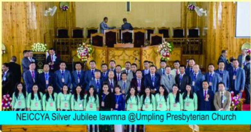
NEICCYA Silver Jubilee lawmna @Umpling Presbyterian Church