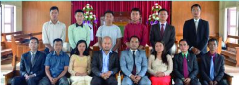
Buarpui Branch KP Tin Jubilee lawmna