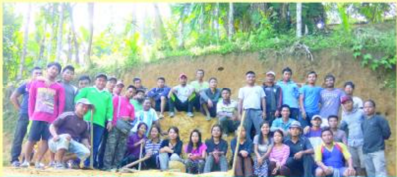
N. Hlimen Bial @ Cachar Kahrawt Bial