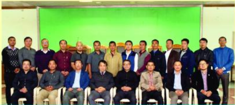
CKTP Orientation cum Retreat