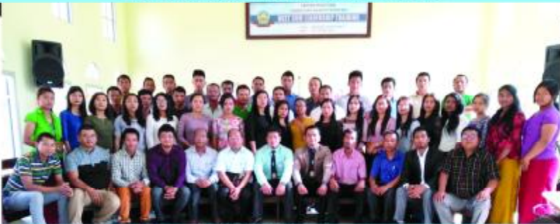
Chhingchhip Mualpui Bial KTP Meet cum Leadership Training