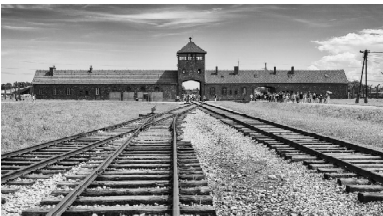
Ur hlumna hmun : Heng hmuna ur hlum tur hian Juda-te chu relin an phur khawm thin.

German ram lal Adolf Hitler-a chuan Europe khawmualpuia Juda-ho nuai chimiturin sipai, Nazi a din a. Juda hmun thuma thena hmun hnih aia tam mah chu a tihlum a. Chung Juda-ho zingah chuan pawl sawi lo hmeichhia leh naupang maktaduai tam tak an tel a ni. Innghaisakna hmun tam tak an siam baw k a, chungah chuan Juda-ho chu thih hlauhawm tak takah hna an thawh luihtir a, chumi hung chhungah chuan innghaisakna hran an la siam leh a, chutah chuan an thih thlengin an sawisa thin.