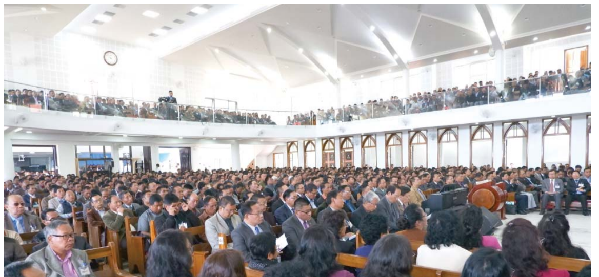
Phek 2-naah zawm...