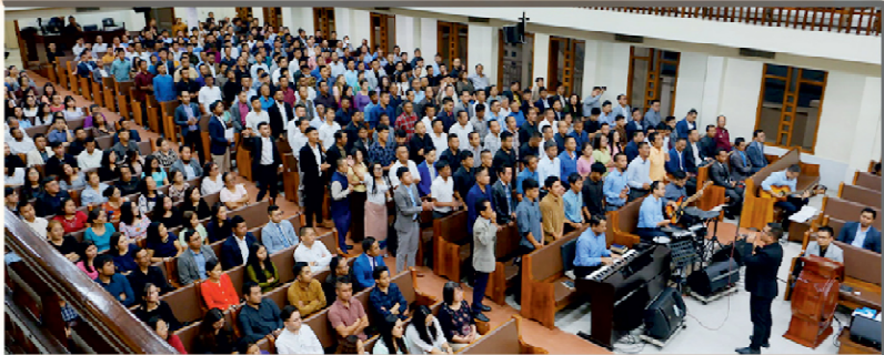
CHHANCHHUAHNA CAMPING KHAR ZAN (25.9.2023) CHANMARI KOHHRAN BIAK IN