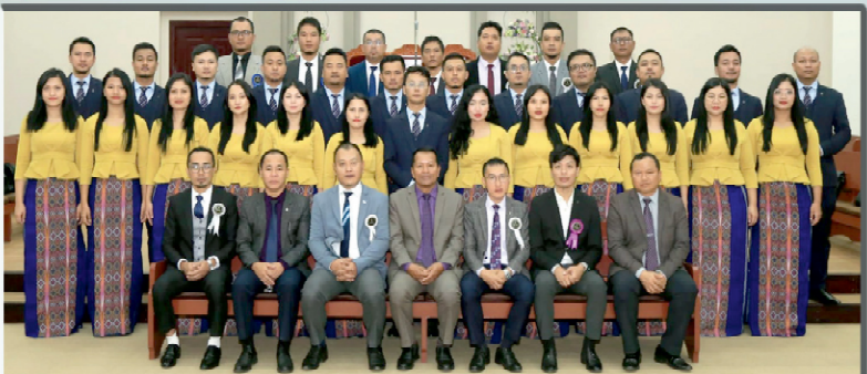
Serchhip Kawnpui Branch KṬP Diamond Jubilee (15.10.2023)