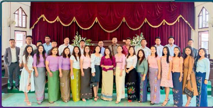
KANTU : LAWNGTLAI CHANMARI BRANCH