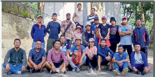
September 28, 2023 khan Dam Veng Branch KTP-te YRC-ah an hntiang