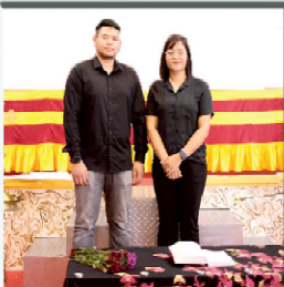
Christian Conference of Asia Kerela-a kalte (Sep.26-Oct.4, 2023)