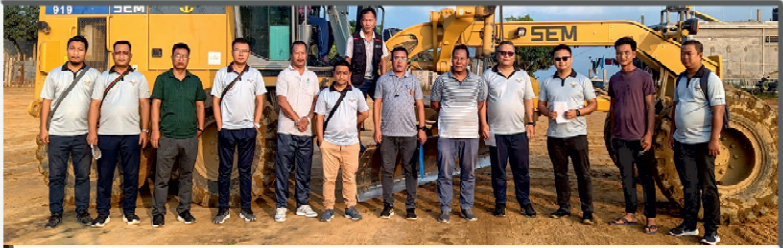
Ni 13.10.2023 khan CKTP hrwaitute Ngopa-ah kalin General Conference thlengtu turte nen inkawmhona an nei a, thlengtu puihna ₹ 15,00,000 an hlan