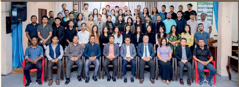
KTP General Conference Diamond Jubilee Concert-atana chanvo neitute inhmukhawm, Saikhamakawn Kohhran Hall (12.10.2023)

MERCHANT NAME: KTP UPI ID: KRISTIANTHALAI@SBI