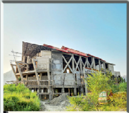
Youth Recreation Centre (YRC) A chung khuh fel a ni