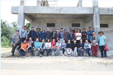
Work Camp Zonum Pastor Bial.