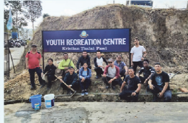
February Ni 25 khan YRC Signboard tar in hnatlang neih a ni.