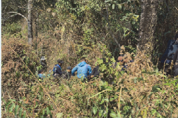
February Ni 18 khan CKTP Committee te leh Synod Choir ten YRC samfain hnatlang an nei.