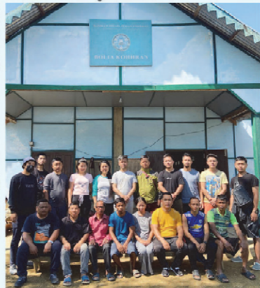
Electric Veng Pastor Bial Work Camp.