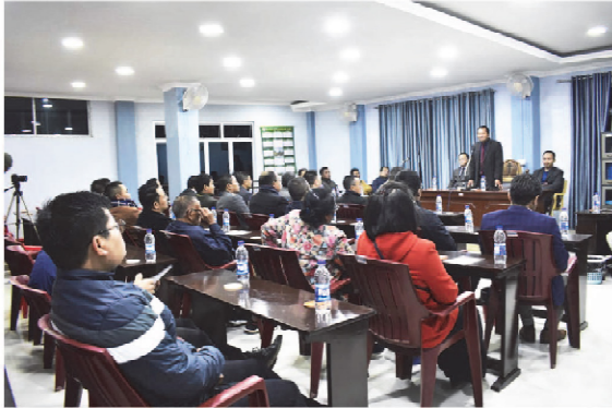
February Ni 7 zan khan KTP Horel Inkhawm thlengtu Zemabaw Kohran te leh CKTP hruaitute inkawmhona neih a ni.