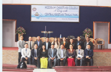
February Ni 10 khan Mizoram Christian College te nen Synod Higher Secondary School ah A day with Central KTP programme hman a ni.