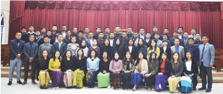
KANTU : FARKAWN BRANCH