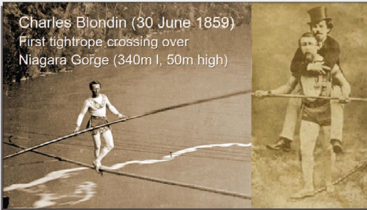
Charles Blondin (30 June 1859) First tightrope crossing over Niagara Gorge (340m l, 50m high)