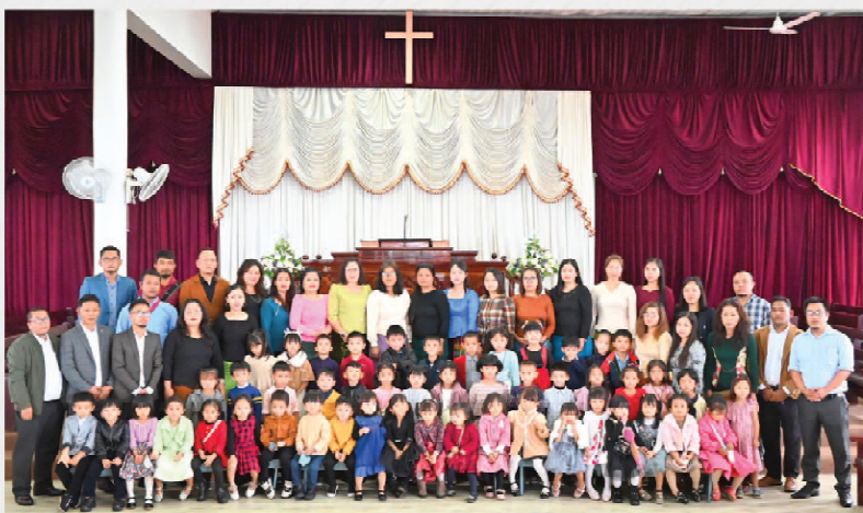
BETHLEHEM KOHHRAN BEGINNER DEPARTMENT LEH PRIMARY DEPARTMENT ZIRLAITE LEH ZIRTIRTUTE 2022