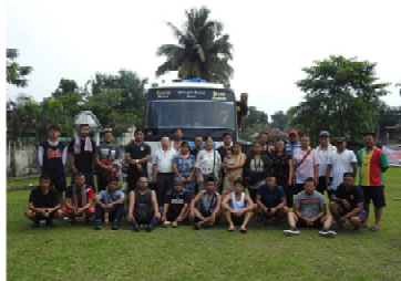
Venghnuai Branch work camp