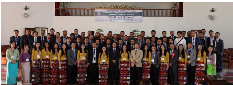
PYF Youth Camp Nov Ni 11-13 chhunga Fiangpul Haflong a Mizoram alawha a palai kal te