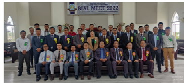
Kolasib Venglai Pastor Bial KTP Meel, Oct 21-23, 2022