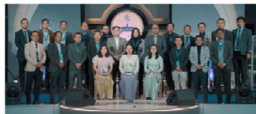
Praise On winner te leh CKTP Commt