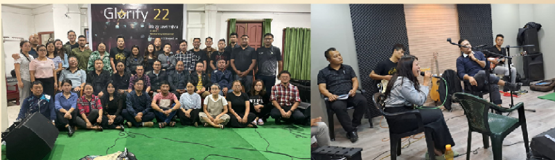
Glorify22 hla zir