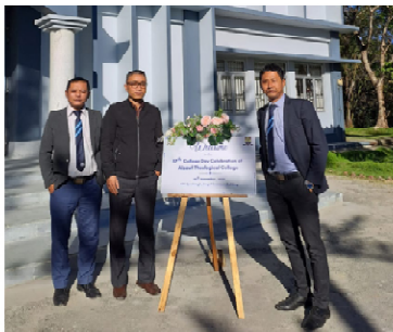
ATC College Day Wawi 57 na lawmnaah CKTP alawha kal te