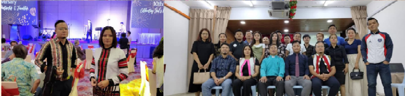
SACYN Meeting @ Kuala Lumpur, Malaysia October Ni 21-25