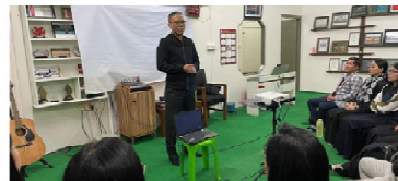
Mizoram Synod Choir Music Video thar. Isua ka hmuh chinah tih chu GS in Nov Ni 8 zan khan choir cabin ah a tlangzath