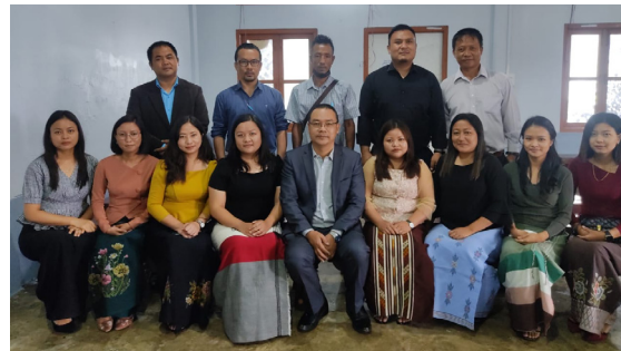
Durtlâng Kohhrana NPSS zirtirtu nê