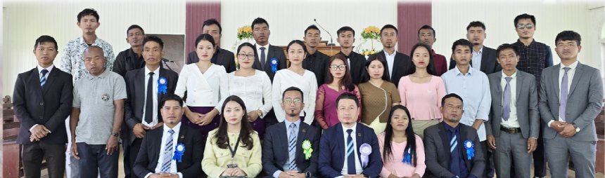
SIALHAU BRANCH KTP GOLDEN JUBILEE (12-13.2.2026)