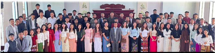
KANTU : KHAWBEL BRANCH