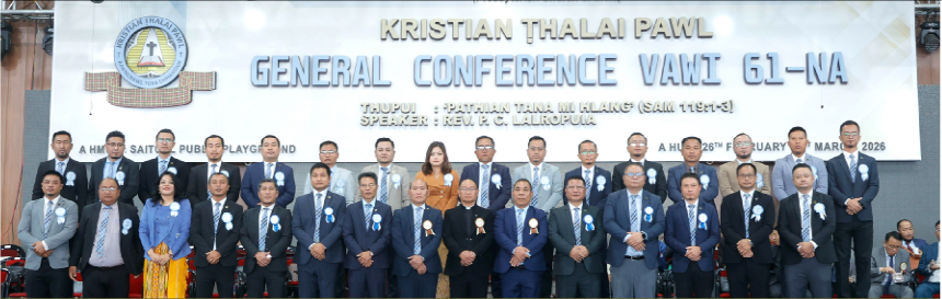
CENTRAL KRISTIAN THALAI PAWL COMMITTEE (2024-2026)