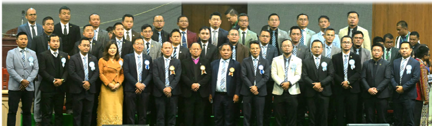
CENTRAL KRISTIAN THALAI PAWL COMMITTEE (2026-2028)