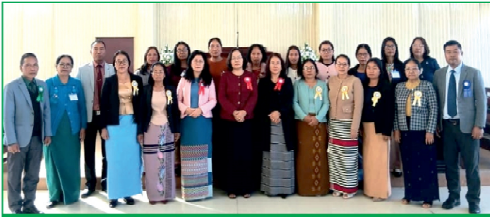
N. Vanlaiphai Pastor Bial Kohran Hmeichhe Inkhawmpui Wawi 57-na