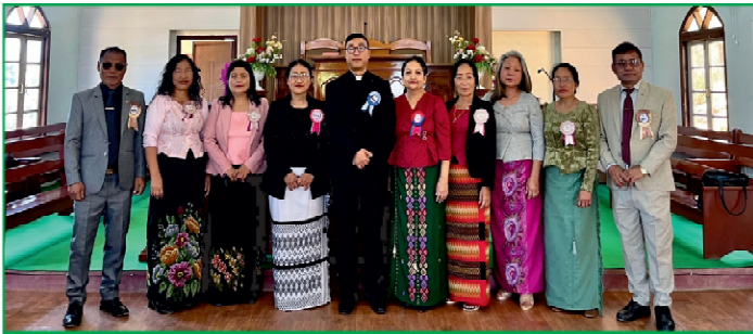
Sangau Pastor Bial Kohran Hmeichhe Inkhawmpui Wawi 29-na