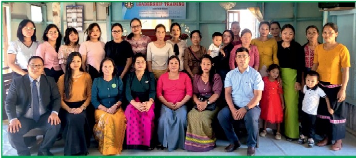
Tuitumhnar Pastor Bial Kohran Hmeichhe Leadership Training

Postal Regn. No. MZR/ 53/ 2024 – 2026 RNI Regn. 40876/ 88