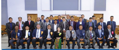
Khuangleng South bial