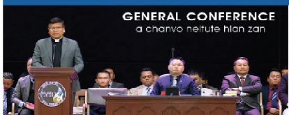
GENERAL CONFERENCE a charvo heitute hlan zan