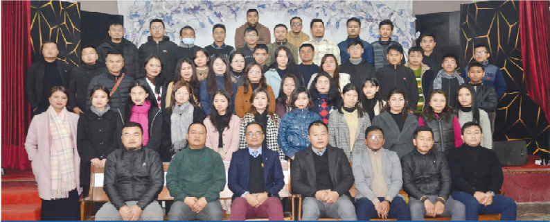
Leitan East Branch Leadership Training

MERCHANT NAME: KTP UPI ID: KRISANTHALA@SBI