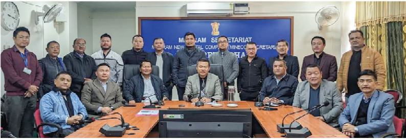
Excise Minister hova Ruihhlo do chungchanga inkawmhona