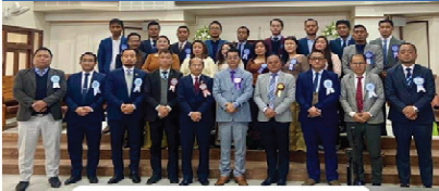
Zemabawk North Bial