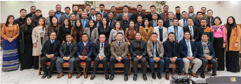
General Conference Hla bu Zan. Electric Veng Branch