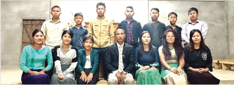
KANTU : CHAMDUR PROJECT BRANCH