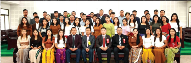
Dulte Branch Golden Jubilee (Nov 30 - Dec 1.2024)