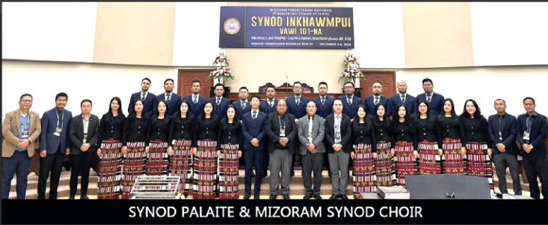
SYNOD PALAITE & MIZORAM SYNOD CHOIR

KRISTIAN THALAI MAN PEKNA Account hming : KTP Account No. : 30045422892 Bank : SBI, Mission Veng Branch IFSC Code : SBIN0007058 Account-a chanchinbu man petuten receipt screen shot whatsapp (8787480280)-ah thawn zel tur a ni.