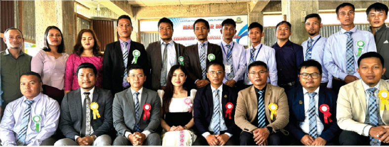
Zawlpui Bial Meet (22-24.11.2024)