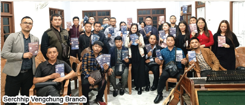
Serchhip Vengchung Branch