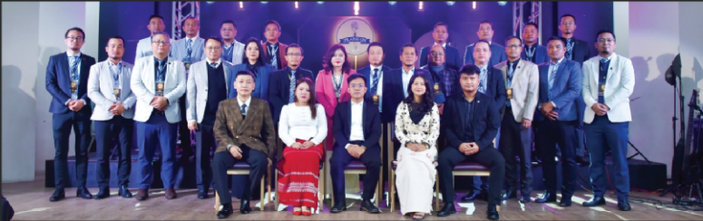
PRAISE ON 2024, C.K.T.P. COMMITTEE