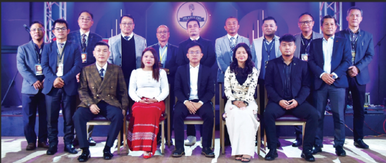
PRAISE ON 2024, ORGANISING COMMITTEE