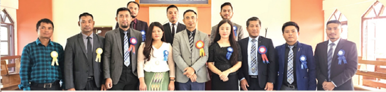
Tuipubari Bial Meet (23-24.11.2024)