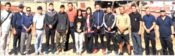
Himali Branch YRC Hnatlang (30.11.2024)