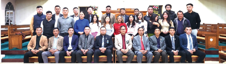
Melthum Branch Peniel (Chanchinbu) Silver Jubilee (18.11.2024)