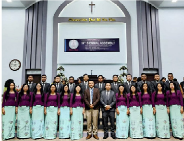
NEICCYA Biennial Assembly ah NEICCYA President leh Presbyterian Choir Lunglei le