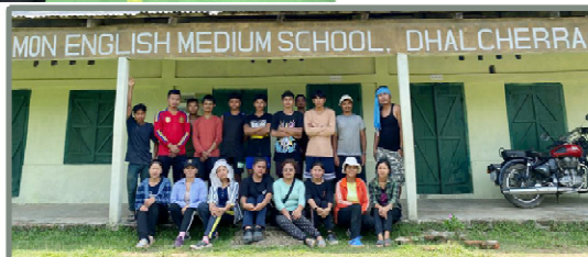
WORK CAMP : N. Chhimluang Branch