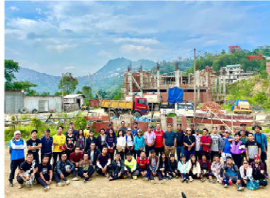
May Ni 28 khang Luangmual Branch ten YRC ah a tul tul thawkin hnallang an nei.