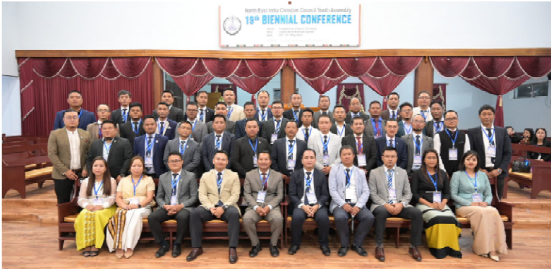
May NI 19-21 chhunga NEICGYA 19th Biennial Conference a KTP alawh paidte.