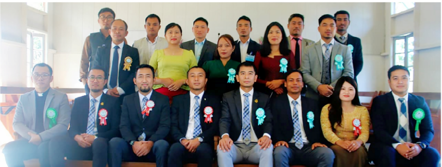
TLABUNG CHAWN PUI BIAL KṲP CONFERENCE (23-25.01.2026)