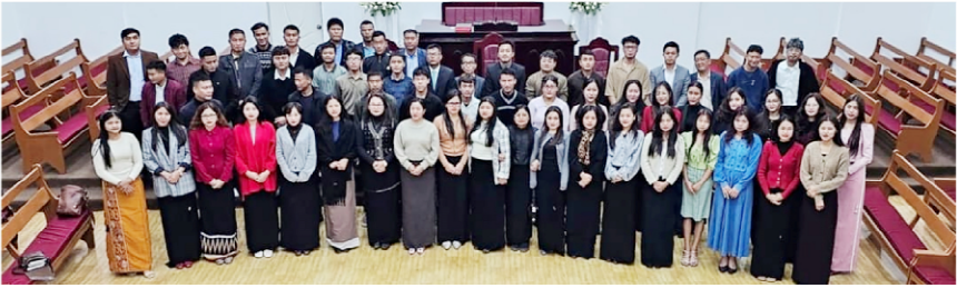
KANTU : KOLASIB VENG LAI NORTH BRANCH