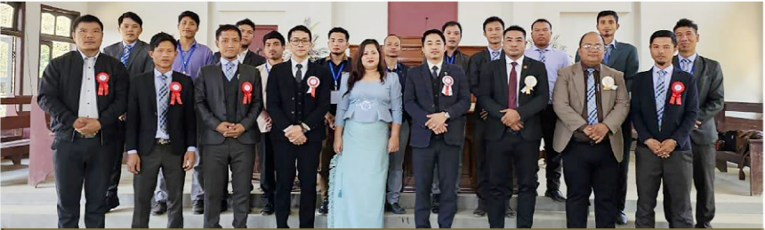
ZAWLPUI BIAL KṲP CONFERENCE (23-25.01.2026)