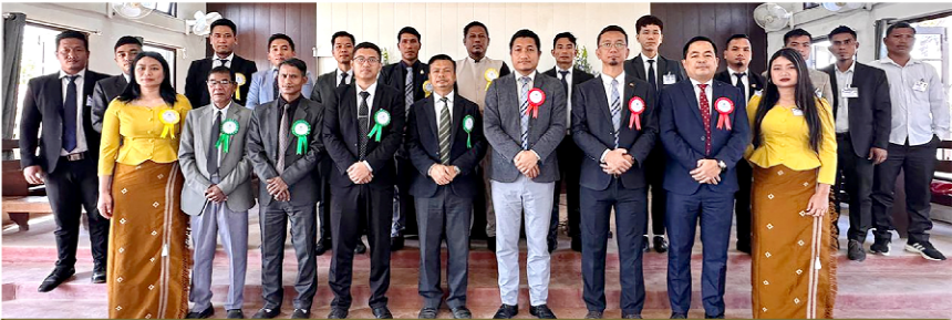
CHAWNGTE P BIAL KTP CONFERENCE (23-25.01.2026)