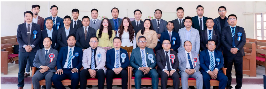
SAITUAL CHHIM VENG BIAL KTP CONFERENCE (23-25.01.2026)