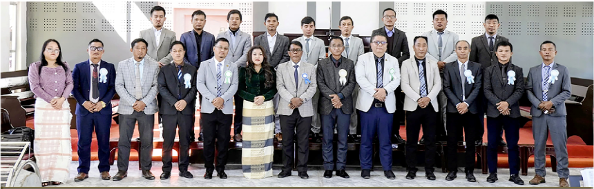
SUMSUIH BIAL KTP CONFERENCE (23-25.01.2026)