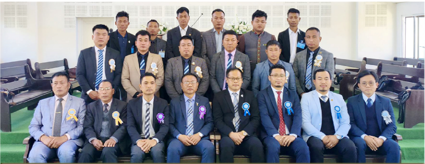
LAWNG LAI CHANMARI BIAL KṲP CONFERENCE (23-25.01.2026)