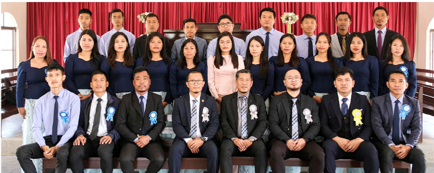
ZAITTE BIAL KTP CONFERENCE (23-25.01.2026)