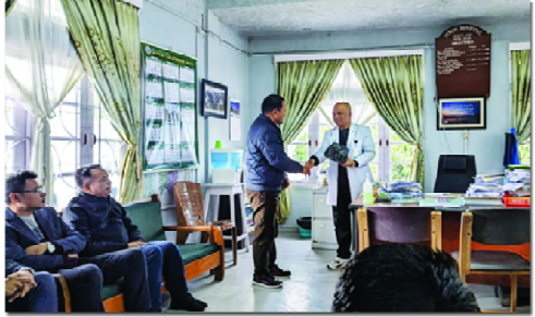
Synod Hospital Director hnenah Charity Fund atan Rs. 11,81,930 leh Grace Home Cook hlawh atan Rs. 96,000 CKTP Leader-in hlan