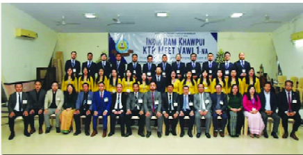
India ram khawpui KTP Meet hlimthla