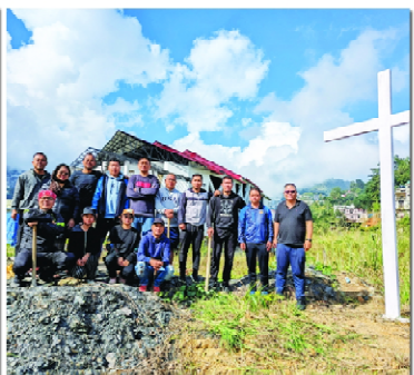
Ni 9.12.2023 khan Ramhlun Sport Complex Branch te YRC-ah an hnatlang