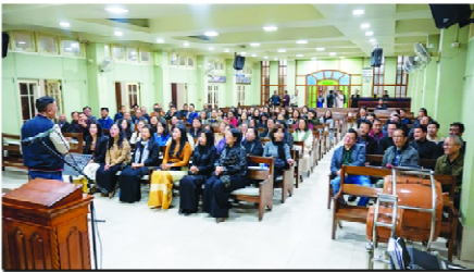
2024 KTP General Conference atan Synod Choir lo ni tawhten Zaipawlpui nei turin hla an zir chho mek

Postal Regn. no. MZR/116/2024-2026 RNI No. MIZMIZ/2009/29074