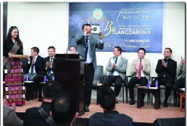
2024 KTP General Conference Hla Bu Leader-in a tlangzarh lai