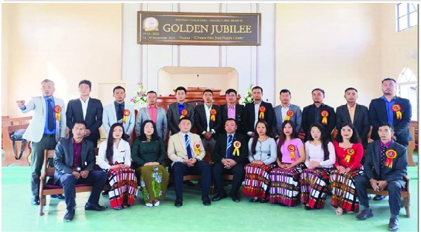
Hrangtlang Branch Golden Jubilee hmanpuia hruaitu kal te