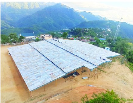
KTP General Conference Pandal tur a chung khuh zawh a ni ta