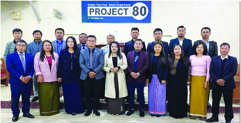
Saitual Venglai Branch Project 80 hmanpuia hruaitu kal te