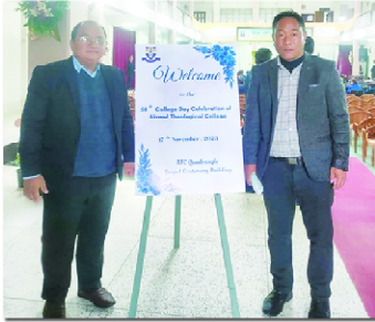
ATC Day Wawi 58-na hmanpuia hruaitu kal te