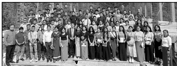
Khuanglêng Pastor Bial KTP