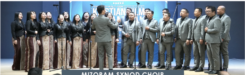
MIZORAM SYNOD CHOIR