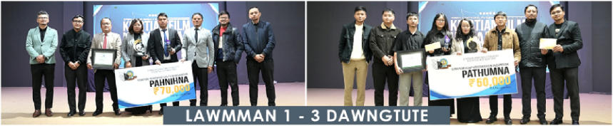
LAWMMAN 1 - 3 DAWNGTUTE