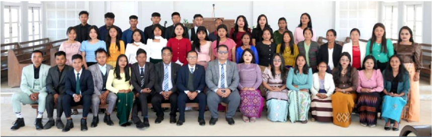
THEKPII BRANCH KṚP SILVER JUBILEE (18-19.12.2025)