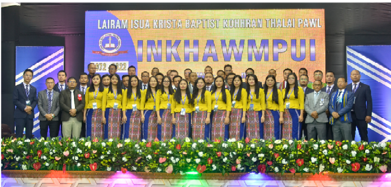
Nov ni 30 - Dec ni 4. 2022 LIKKBKTP Inkhawmpui