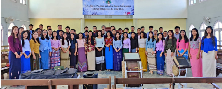
KANTU: Tualcheng Branch