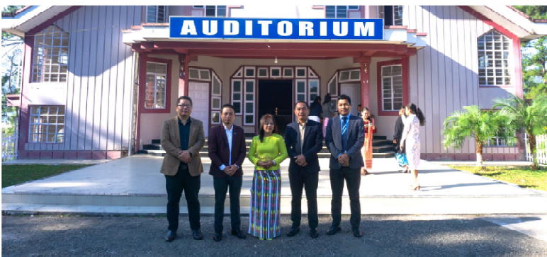
November Ni 23-24 NEICCYA Youth Fest UCC. Barapani Shilong a kal te