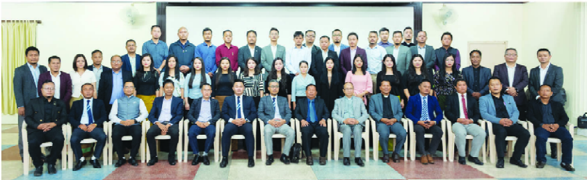
Mizoram Synod Choir Member te leh Central KIP Committee Member te