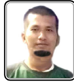
— Sarah-i Pa Diakkawn Branch, Kolasib

Dam chhung tawi teah hian, hei hi a pawimawh ber; Isua i nei tawh em? In chhungkua in dam em? Muanna i chan theih nan, nang leh i chhungte chu; Chhandamna lawngah hruai lut thuai rawh.