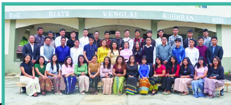
Kantu : Biate Venglai Branch