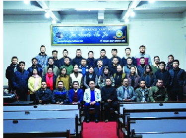
General Conference inbuatsaihna zal hruaitute hlmthla