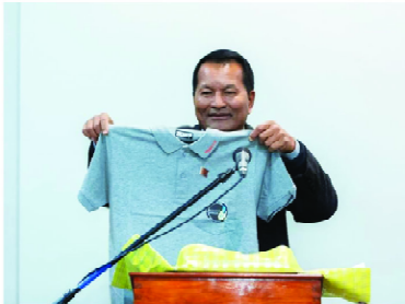
General Conference Diamond Jubilee T-Shirt CKTP Leader-in a tlangzarh

Postal Regn. no. MZR/116/2024-2026 RNI No. MIZMIZ/2009/29074