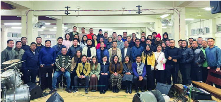
General Conference inbuatsaihna Jubilee Concert hla zir