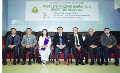
Ruihlo do chungchanga Kohhran Thalaj nena inkawmhoahna OB te an tci ve