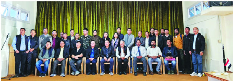
KTP General Conference Organising Committee te leh Central hruaitute