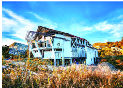
YRC Convention Centre hlimthla