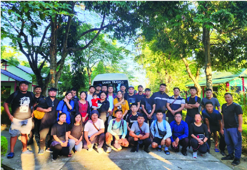
Work Camp - Falkawn Branch