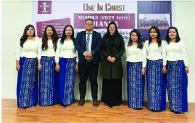
One in Christ 2024 term inhlantarna hmanpuia hruaitute chhuahna