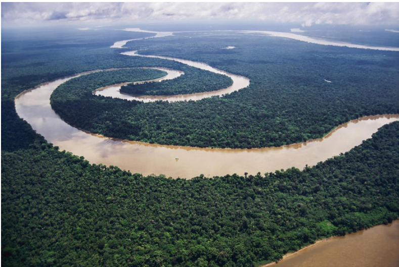
Amazon luipui - khawvela lui sei ber dawttu chu

nei chi bakah maimawm, rul lian chi (Green Anaconda) te, keite chikhat (Jaguar), tui rûl hlauhawm zet mai (Electric Eel) te, rûl tûr nei hlauhawm tak mai (South American Rattlesnake) an tih te leh khawvela fanghmir hlauhawm ber pawl (Bullet ant) an tih mai, a seh pawh silaia kah tluk zeta na nia an sawi te, sangha ha hriam ṭha em em mai leh hlauhawm zet mai Red Bellied Piranha an tih te pawh he Amazon ramngawah hian an cheng a ni.