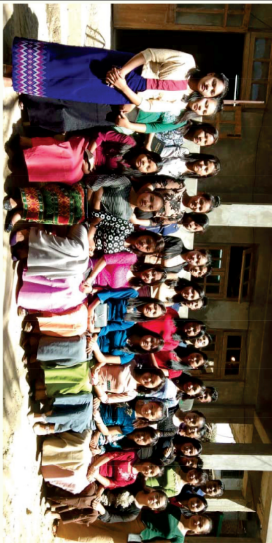
DINTHAR SAIRANG SENIOR DEPARTMENT 2019