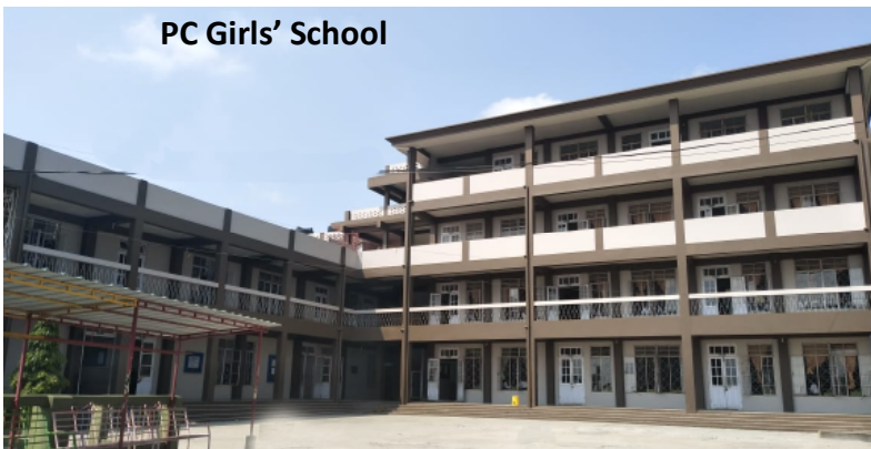
PC Girls' School