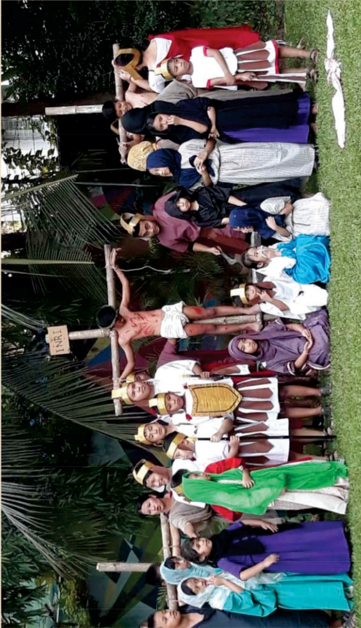
Kolkata Naupang Sunday School zirlaiten Good Friday-ah lem an chang