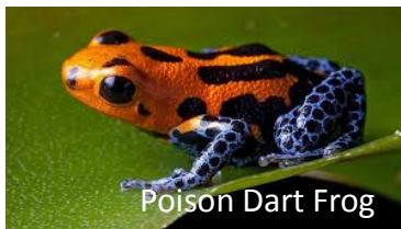
Poison Dart Frog

Amazon ramngaw zaa sawmruk (60%) hi Brazil ram chhung a ni a, Peru ram chhungah zaa sawmpathum (13%) awmin, Colombia ram chhungah zaa sawm (10%)