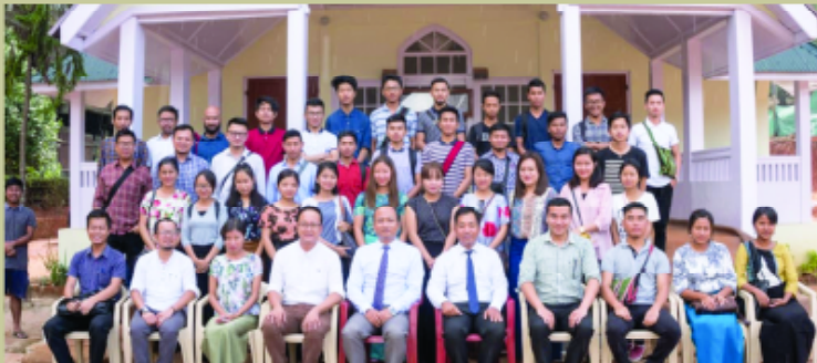
Shillong Branch Leadership Training