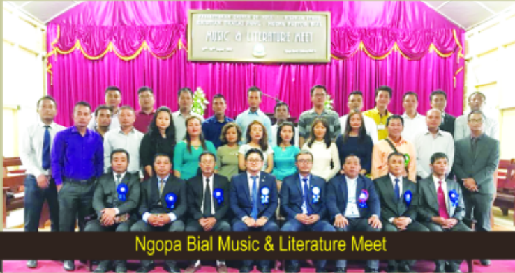
Ngopa Bial Music & Literature Meet