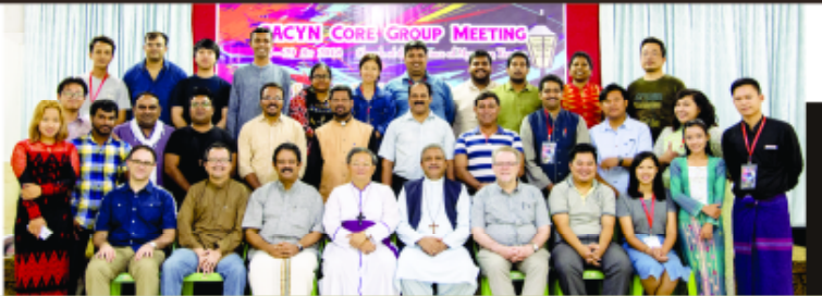
SACYN Core Group Meeting

Postal Regn. no. MZR/81/2018-2020 RNI No. MIZMIZ/2009/29074