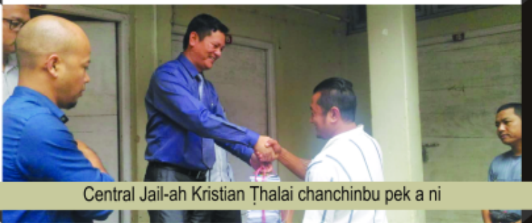
Central Jail-ah Kristian Thalai chanchinbu pek a ni