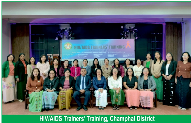
HIV/AIDS Trainers' Training, Champhai District