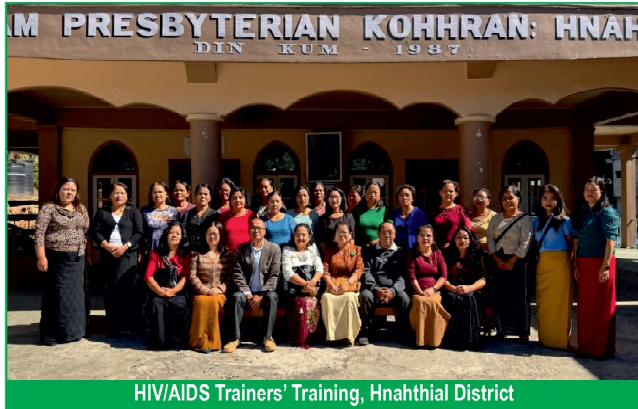
HIV/AIDS Trainers' Training, Hnahthial District

Postal Regn. No. MZR/ 53/ 2024 – 2026 RNI Regn. 40876/ 88