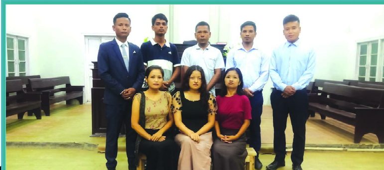
Kantu : Tlabung Zodin Branch