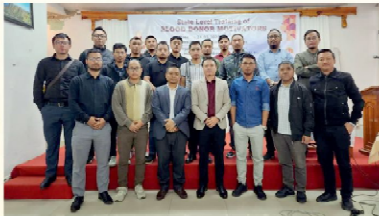
March Ni 24, State Level Training on Blood Donor Motivator 2023 neitha CKTP aiawh leh bial aiawh palai kal le

MERCHANT NAME: KTP UPI ID: KRISTIANTHALAI@SBI