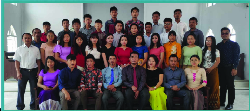
Kantu : Chhipphir Branch