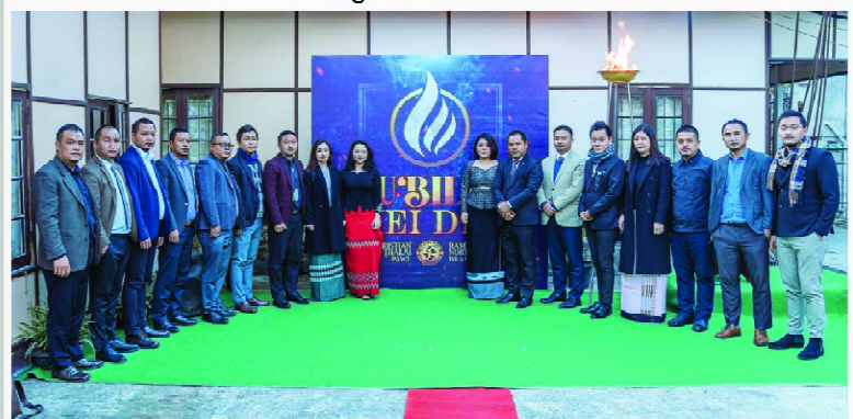
Ramhlun North Branch Golden Jubilee