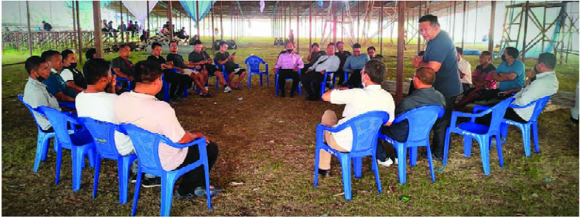
Conference Organising Sub Committee hrang hrang leh CKTP hruaitute

Postal Regn. no. MZR/116/2021-2023 RNI No. MIZMIZ/2009/29074