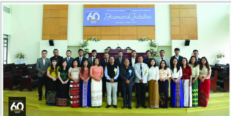
Chhinga Veng Branch Diamond Jubilee