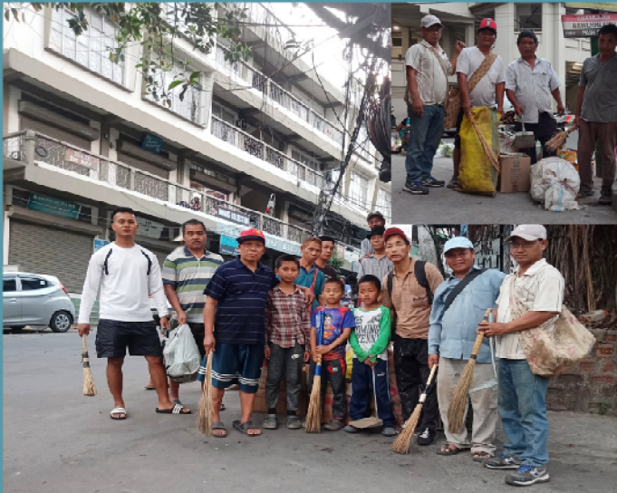
Centenary Kohhran Ramthar Committee hualhawtin Kohhranhote Mission Veng Bazar phiait fain an inhlawh