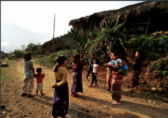
Pangkang Kohhranhovin Tumkau Ni-ah kawng an zawh (Boleng Pastor Bial, Arunachal 'N')

If not delivered please return to: The Manager Ramthar Chanchinbu Synod Office, Aizawl, Mizoram, India. Pin - 796001