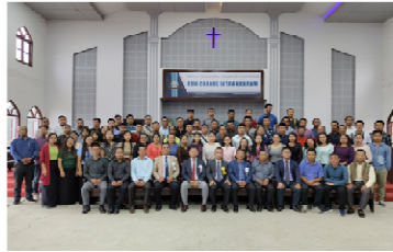
June Ni 9-11: Phuaibuang Bial KTP Meet leh Leadership Training.