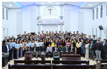
June Ni 30: Champhai Kanan Bial Leadership Training.