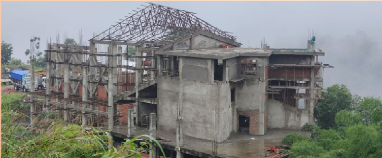
YRC Convention Centre a chung an khuh mek a ni