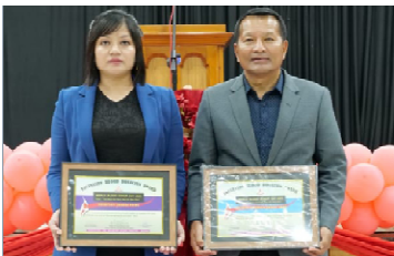
AVBD ten thisen pe tam lawmman an semah KTP te a pumpuah 2-na min Religious Group ah 1-na dinhmun kan hauh a lawmman kan dawng.