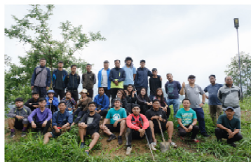
June Ni 17: Electric Vengthlang Branch te YRC-ah an Inatlang.