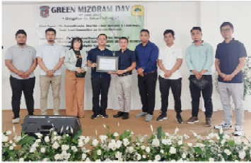
Forest Department-in Ram kang Awareness Video clip inelna Kohhran Thalai Pawl hrang hrangte tana a buatsaih-ah CKTP aiawha telte zingah Vaivakawn Branch leh Bethlehem North Branch ten lawmman Branch leh Bethlehem North Branch ten lawmman lain lawmman te hi CKTP hruaituten an laksak.