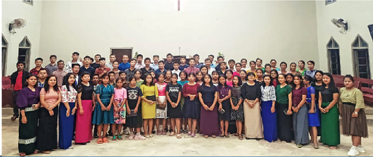
KANTU: Damparengpui Branch