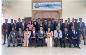
June Ni 23-25: North Vanlaiphai Damdawi Veng Bial KTP Meet.