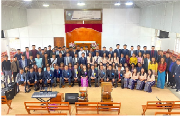
June Ni 9-11: Kawlkuh Bial Meet leh Leadership Training.