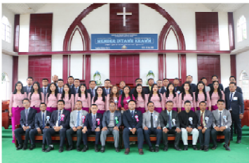
June Ni 23 - 25: Chhiahtlang Bial member intawhkhawm.